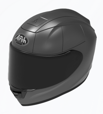
Autoliv | AIROH